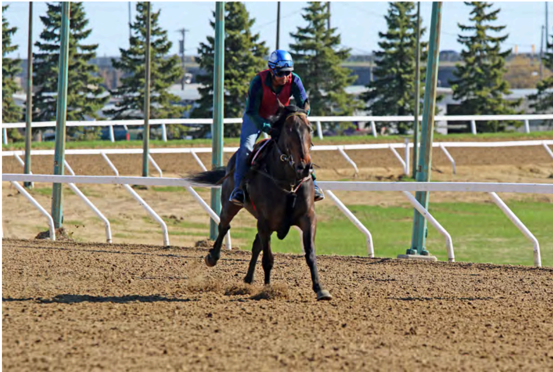
Sunny morning gallop.