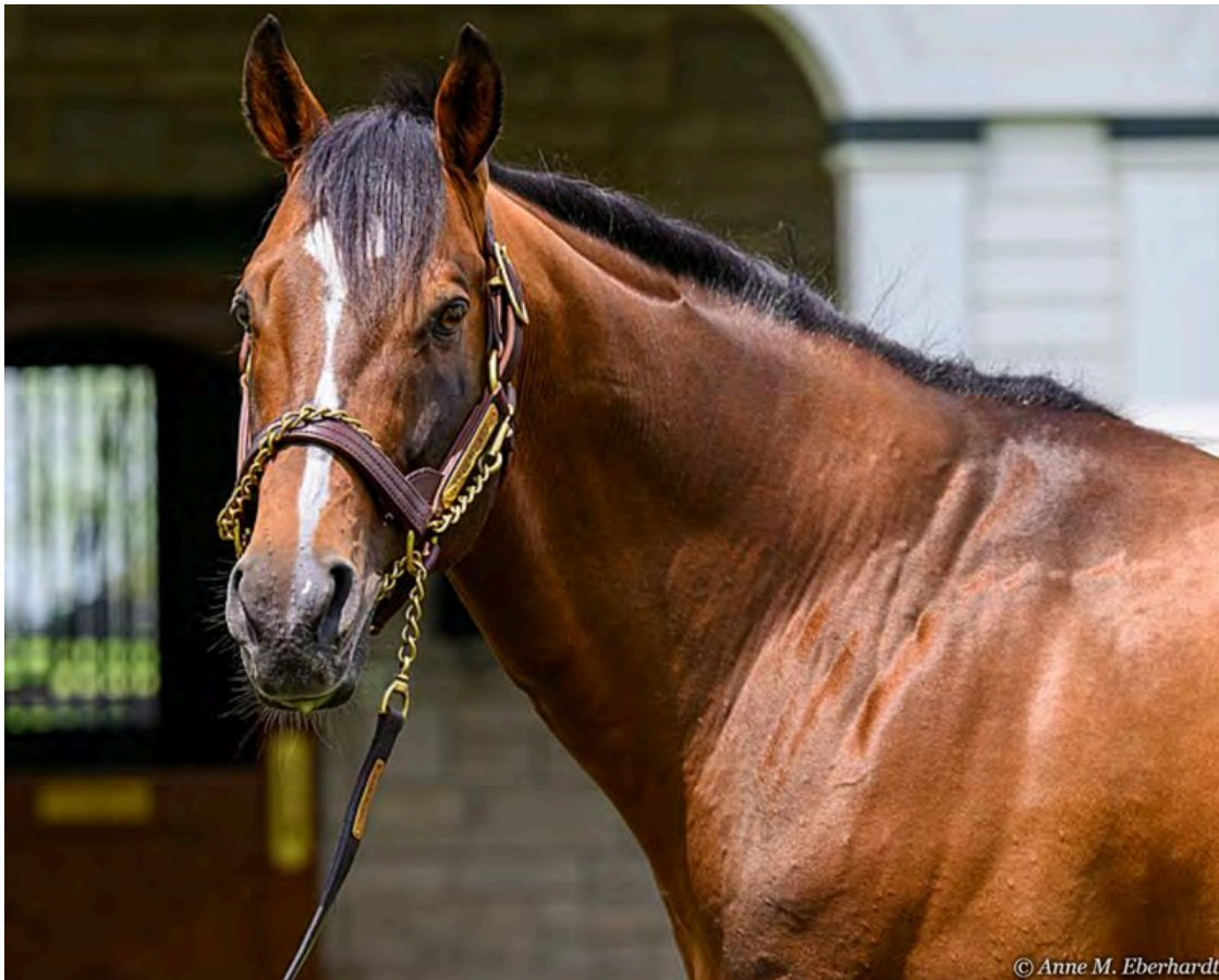
Goldencents at Spendthrift Farm

Goldencents, who is out of the Manitoba-bred mare Golden Works, has been a successful sire since his first crop debuted in 2018, but following his son Mystik Dan's win in the Kentucky Derby (G1), he could be in store for his best year yet as a sire. More from the Blood Horse here .