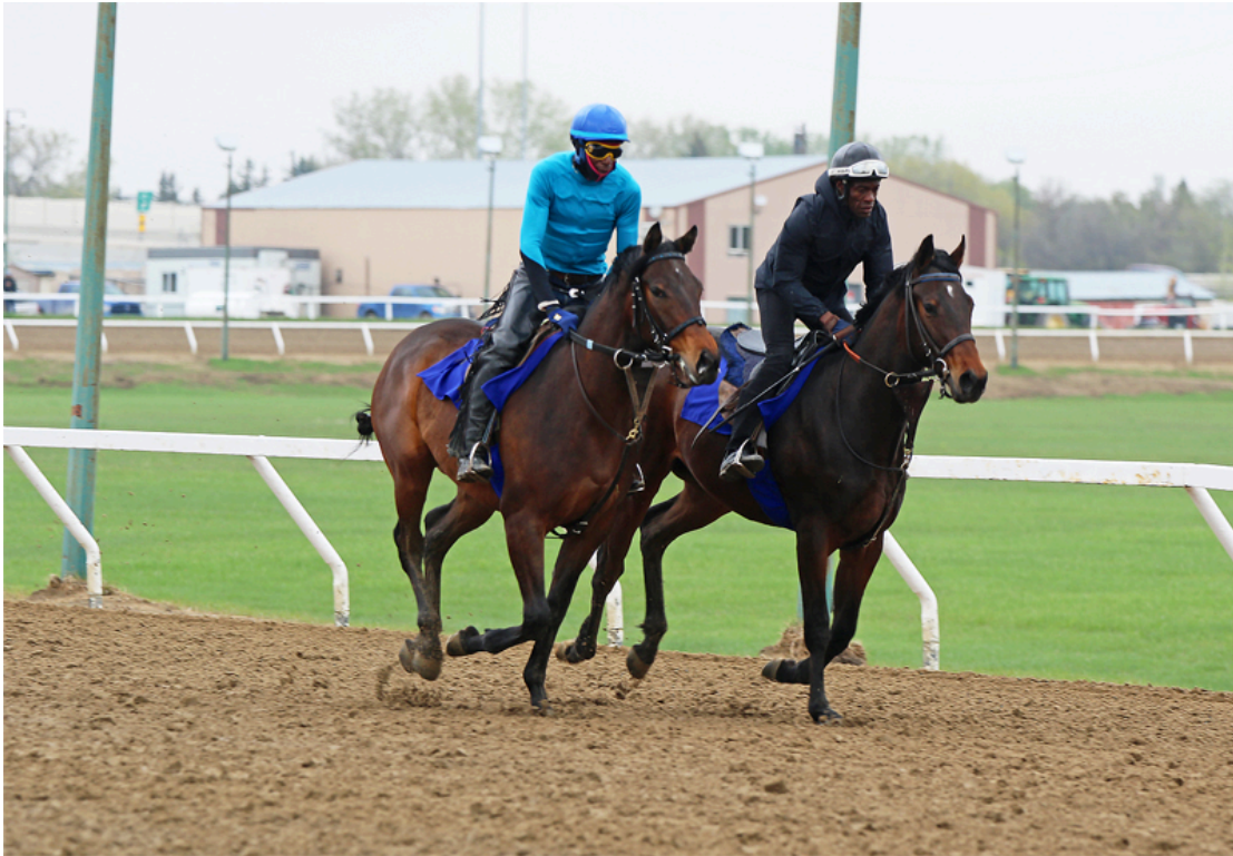
Youngsters getting ready for opening night at Assiniboia Downs on Monday.