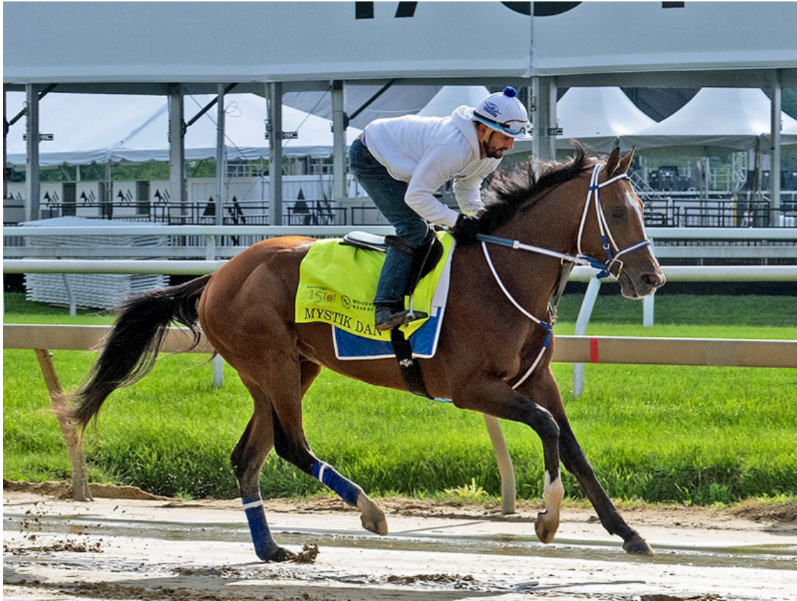
Mystik Dan at Pimlico.