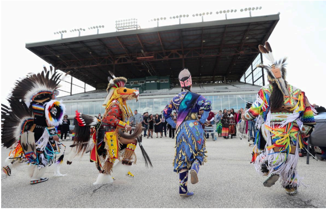
Indigenous dancers at the Treaty One Flag raising ceremony on Monday at ASD.