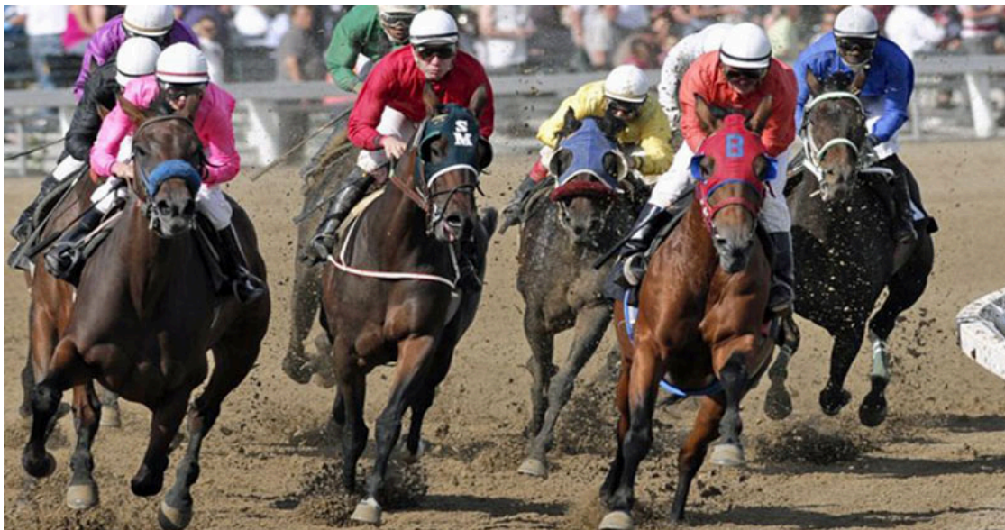
Horses entering the clubhouse turn at Assiniboia Downs.

Assiniboia Downs has announced a temporary change to its racing schedule for the remainder of the meet due to proactive measures taken in response to a recent equine health concern. Starting the week of July 15, racing will shift to a two-day Monday-Tuesday schedule until August 12, after which the regular three-day Monday-Tuesday-Wednesday schedule will resume. More from the Canadian Thoroughbred here .