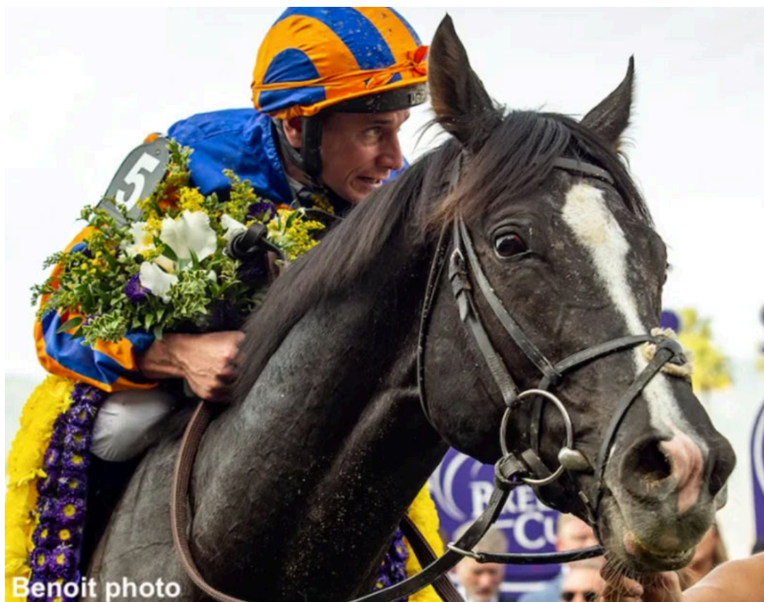
Six-time Grade 1 winner Auguste Rodin.

Three international contenders have jetted in for the 2024 edition of the Japan Cup (G1), led by 2023 Breeders' Cup Turf winner Auguste Rodin for trainer Aidan O'Brien. The six-time Grade 1 winner skipped this year's Breeders' Cup, and instead heads to the 1 1/2-mile turf event on Sunday in search of the first-place prize of about US$3.2 million. France fields Goliath, winner of this year's King George VI and Queen Elizabeth Stakes, and Germany brings this year's Grosser Preis von Baden champion Fantastic Moon to the table. More from the Paulick Report here .