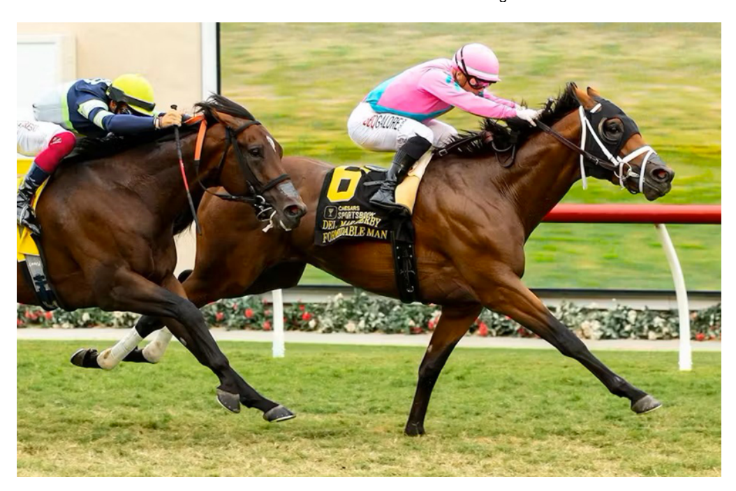
Formidable Man wins the Del Mar Derby at Del Mar.