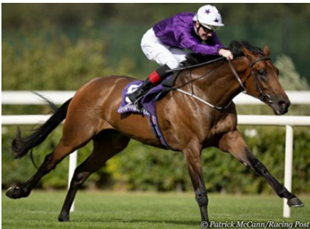
Hill Road has been listed as the 5/2 second choice in the Peter Pan Stakes on Saturday.