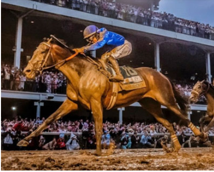
Sovereignty wins the 151st Kentucky Derby.