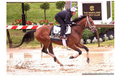
Journalism is a deserving favourite in the Preakness Stakes on Saturday.