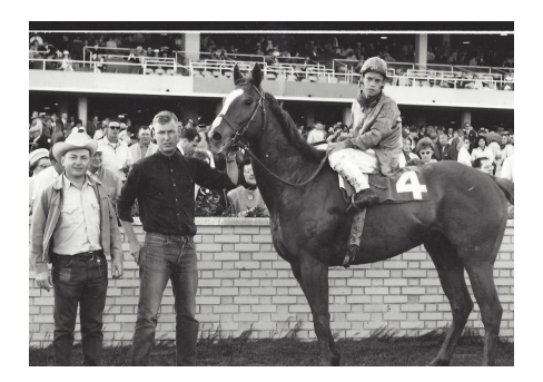
Click photo to enlarge