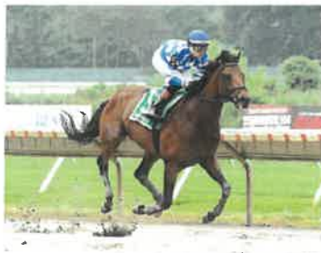
Pegasus Stakes winner Bracket Buster has been listed at 10-1 for the $1 million NYRA Bets Haskell Stakes at Monmouth Park on Saturday.