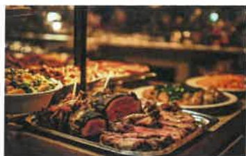
Certified Angus Prime Rib Buffet. Every live race night!