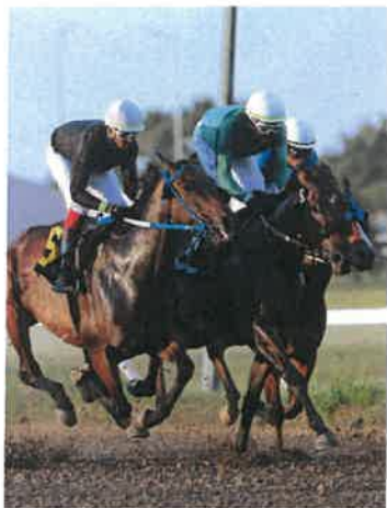
Live Racing starts at 7:30 p.m.