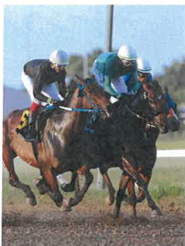
Live Racing starts at 7:30 p.m.