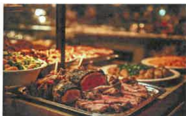
Certified Angus Prime Rib Buffet.