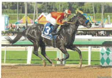
Speed Boat Beach is the horse to beat in this Saturday's Pat O'Brien Stakes at Del Mar.