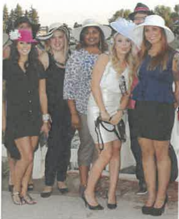
Girls Night Out - Wednesdays until October 8th.