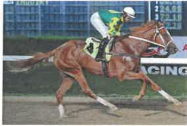
Champion No Show No Call has a half-brother in Sunday's CTHS Manitoba Yearling Sale.