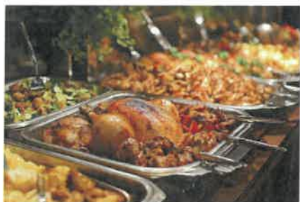
Thanksgiving Buffet Tickets on Sale Now!

Check out this week's predictions and see who's primed for victory here .