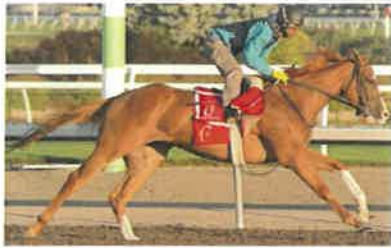
Win for the Money preparing for Saturday's Rogers Woodbine Mile