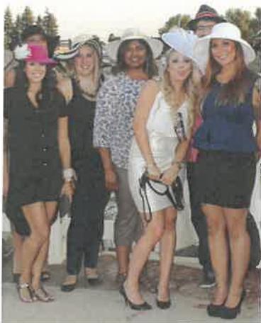
Girls Night Out - Wednesdays until October 8th.