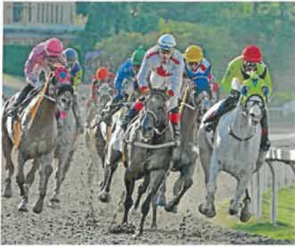
The $125,000 BC Derby on Sept. 13 at Hastings Racecourse features a compelling storyline.