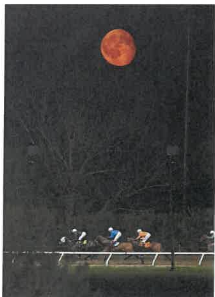
Moon over ASD Tuesday, Sept. 9, 2025. Click photo to enlarge.

Don't wait - call 204-885-3330 to order your tickets today!