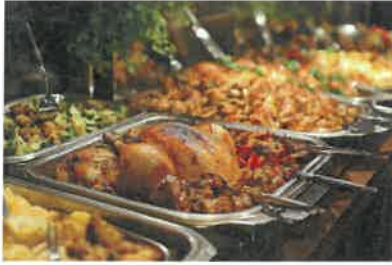
Thanksgiving Buffet Tickets on Sale Now!