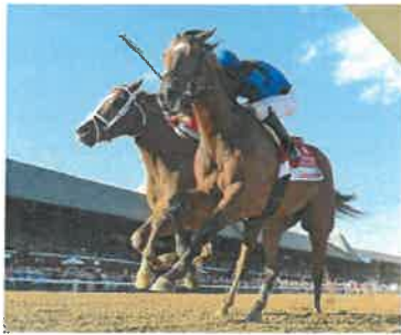
Phileas Fogg has the talent to lead from start to finish in the Woodward Stakes on Saturday.