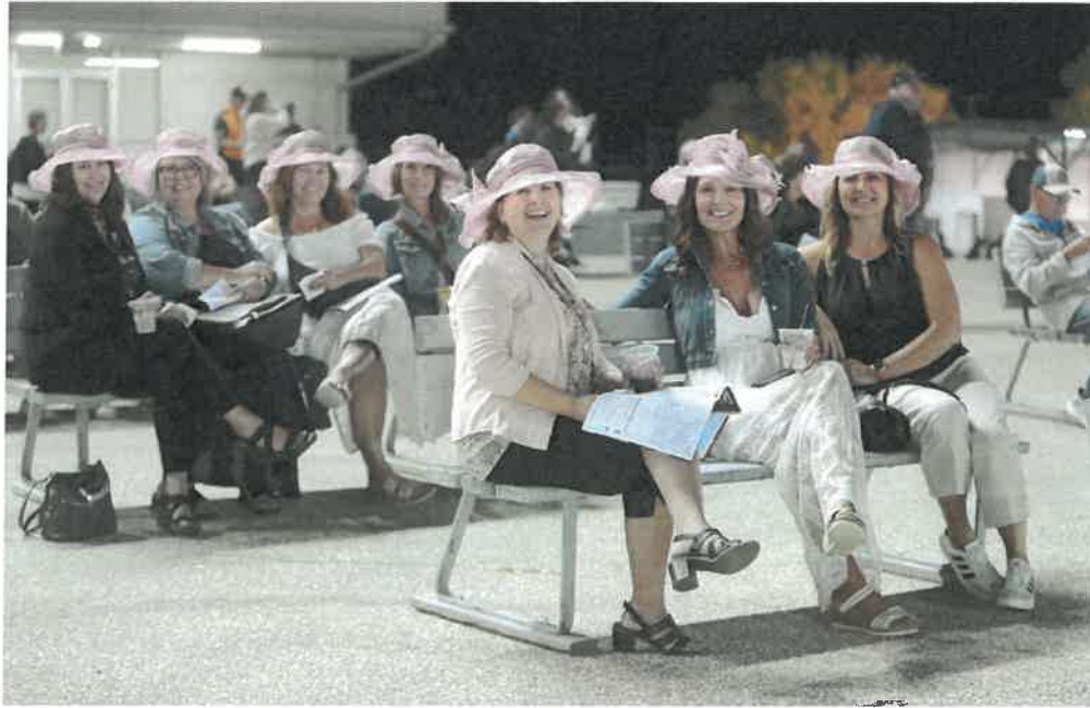
Ladies wearing smiles and pink hats filled the benches on Girls Night Out Wednesday at ASD.