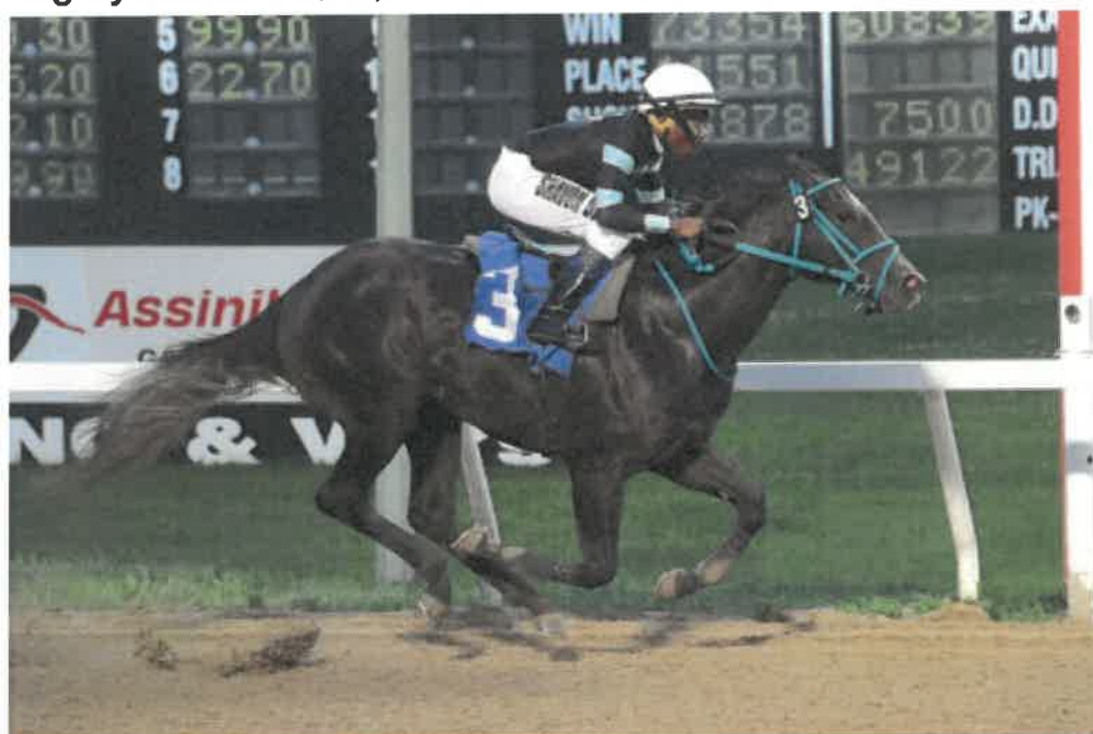
Mighty Mikee and Shavon Belle win the $40,000 Buffalo Stakes.