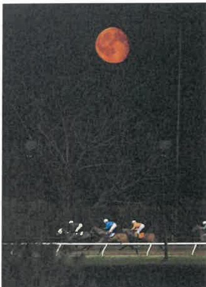
Racing under the Harvest Moon at ASD. Click image for full size.

Week 18 is here and the stakes couldn't be higher — division titles, playoff seeding, and postseason lives on the line. I've got three games that caught my eye this weekend, including a Saturday night NFC West thriller and a Sunday night AFC North battle that's going to be a war. After going 2-1 last week, I'm sitting at 33-18 on the season. Let's finish strong. Check out the full breakdown here .