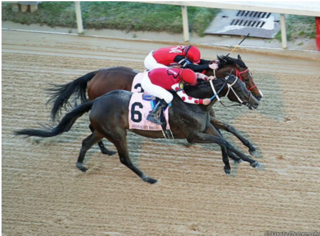
Escape Clause (inside) and Midnight Bisou at the wire in the 2019 Apple Blossom Handicap.