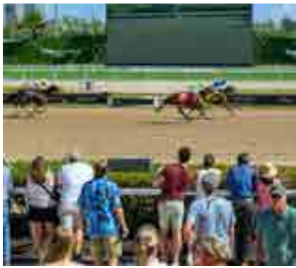
Fans enjoy sunshine and great racing at Gulfstream Park.