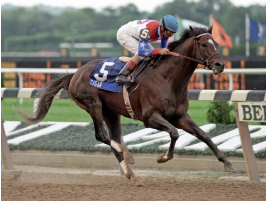
Cigar in the midst of his 16-race winning streak at Belmont Park in 1995.

The 7-time Canadian champion also won numerous graded stakes in the United States and set a new track record going 1 3/8-miles on the turf at Belmont Park in the Bowling Green Handicap.