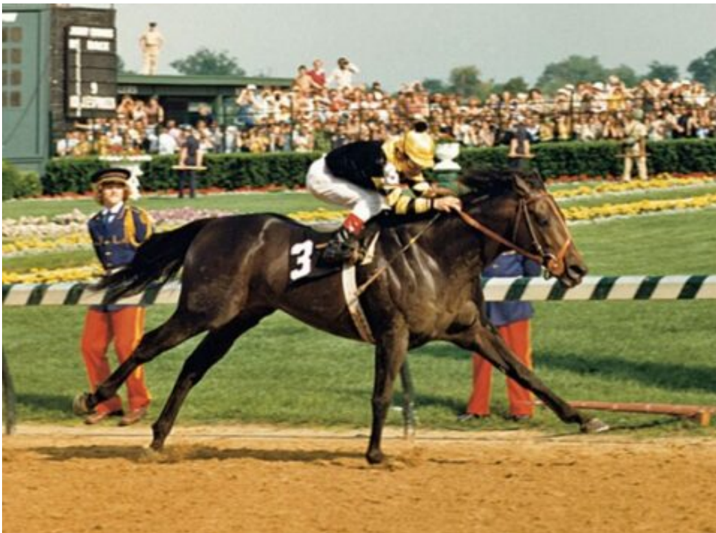
Seattle Slew winning the 1977 Kentucky Derby.

Slew took the lead out of the gate and never looked back. They were NEVER going to beat him. Seattle Slew won the first nine starts of his career including the Kentucky Derby (G1), Preakness (G1), and Belmont Stakes (G1), and finished his career with a record of 14-2-0 from 17 starts. When he lost, he had major excuses.