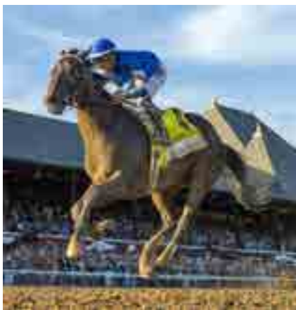
Sovereignty, the front-runner for 2025 Horse of the Year, is also a finalist for the Eclipse Award as champion 3-year-old male.