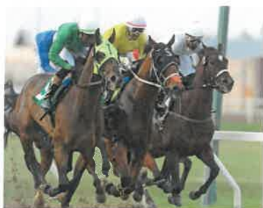
Horses charge towards the first turn in Race 3 on June 1 at ASD. Click image for full size.