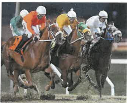
Live Racing every Tuesday and Wednesday plus select Mondays