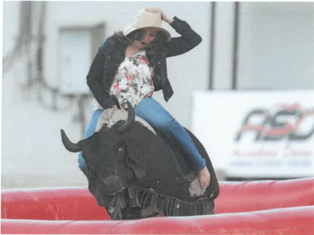
Hold on to your hat!