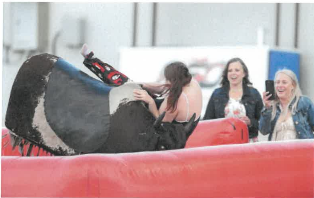
And down we go!