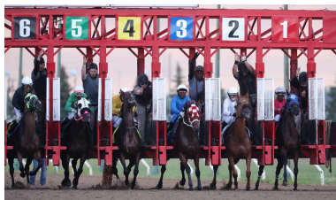
Horses break out of the gate for race 4 on Wednesday, July 1.