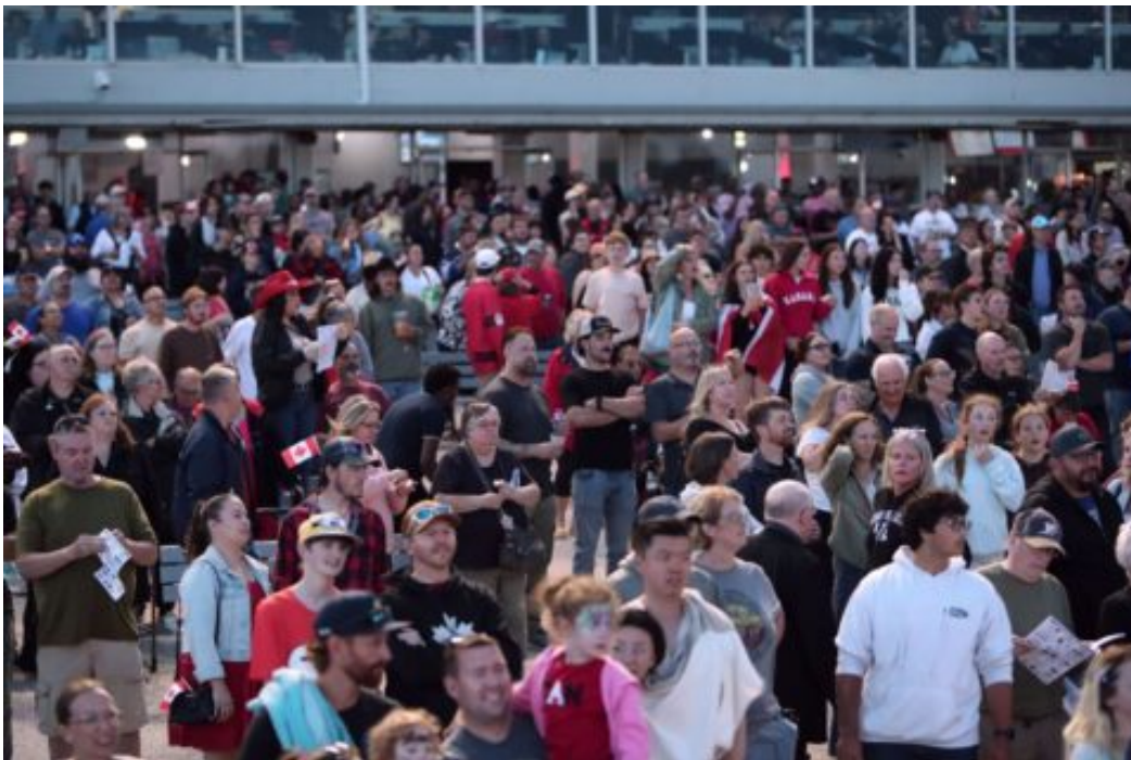
Over 10,000 fans packed Assiniboia Downs to celebrate Canada Day, enjoying an exciting evening of live horse racing before capping off the festivities with a spectacular fireworks display.