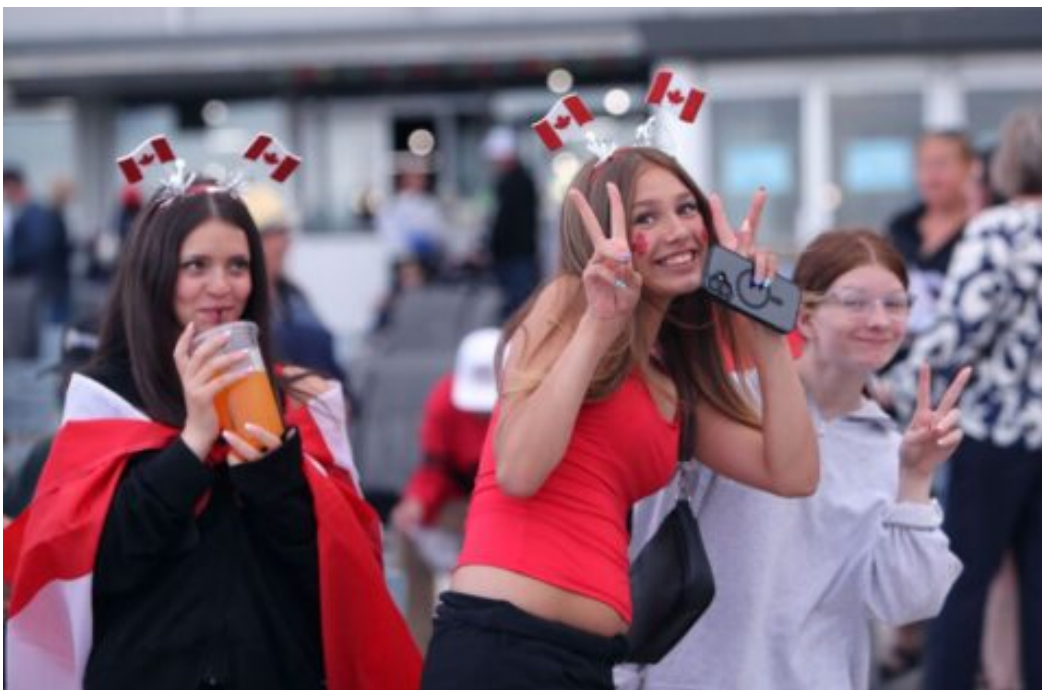
Canada Day spirit was on full display as race fans arrived dressed in red and white, proudly sporting Canadian flags while enjoying a great night of racing.