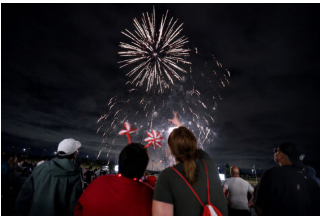
The Canada Day celebration concluded with a spectacular fireworks display by CanFire Pyrotechnics that lit up the night sky. What a great way to end the night!

Live racing resumes next Tuesday with free family fun activities and Wednesday featuring our popular Girls Night Out at 7:30 p.m. Free admission and parking!