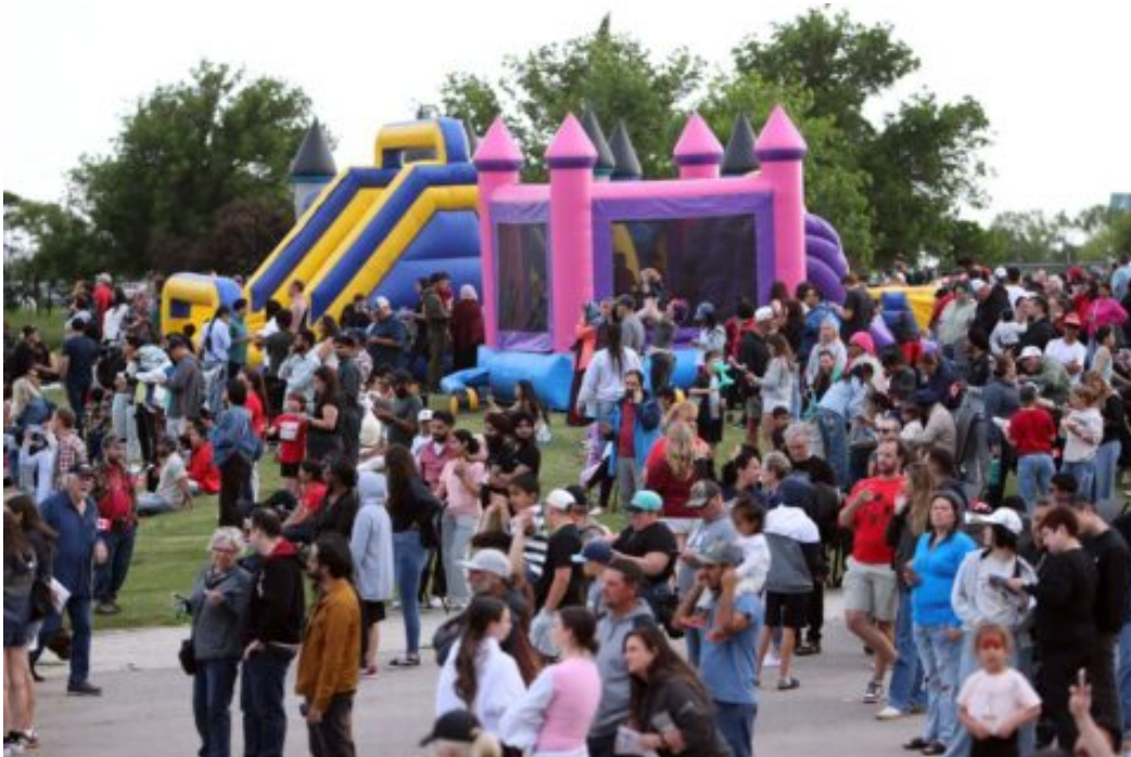
A huge crowd enjoyed the free family fun activities, with bouncers, face painting and live entertainment for the kids. Free family fun returns every Tuesday in July and August from 6 p.m. to 9 p.m., making the track the perfect place for a family night out.